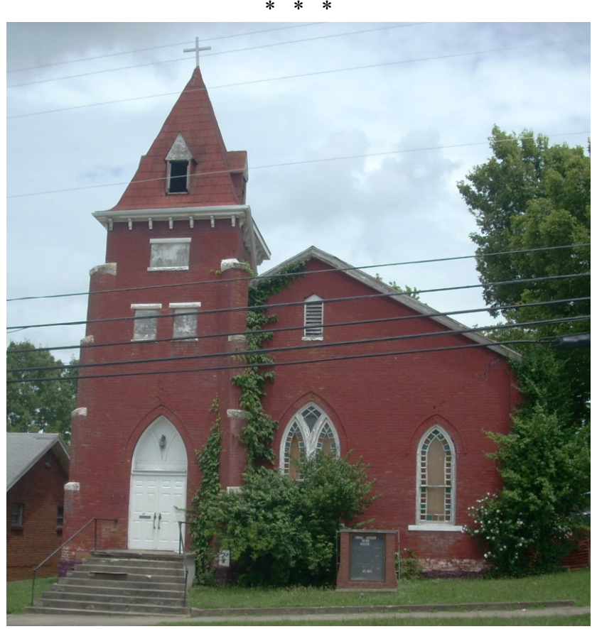
Allen Chapel CME today

Establishment dates given in this article are taken from deeds of trustees purchasing property on which to build a church.* While this may not be precisely accurate, other data are simply not available. Other documentation comes from county records and a few published church histories. The list of churches is fairly impressive, and it's possible I may have missed a few.