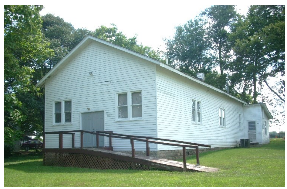
Houston Baptist Church today