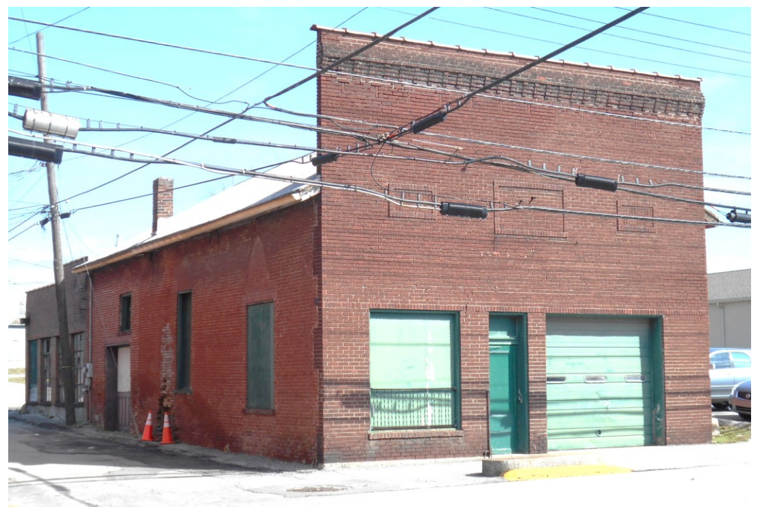
The old AME Church today

Clark United Methodist is an inclusive, neighborhood-focused church currently pastored by Chrysanthia Carr-Seals. Their original building on East Broadway has been purchased by Pillar of the Community and is currently being restored by Mt. Folly Enterprises.